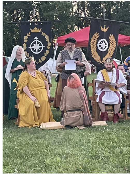
Kale being inducted into the Order of Brigits Flame.