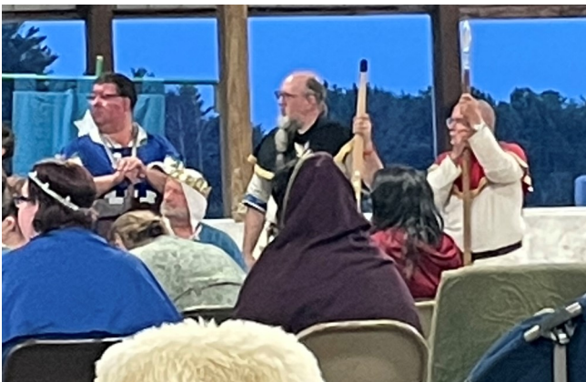
The Baronial Champions in WW Court